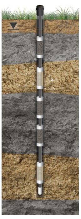
Typical 3-Channel CMT Installation in Overburden with Bentonite and Sand Cartridges

\begin{tabular}{ll} \textbf{Saves Cost} &- through reduced permitting and drilling costs; and because narrow tubes allow smaller purge volumes, reduced disposal costs, efficient low flow sampling and rapid response to pressure changes, all reduce field time. \\ \end{tabular}