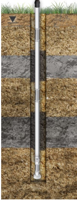
Typical 3 or 7-Channel CMT Installation using Layers of Bentonite and Sand Backfilled from Surface