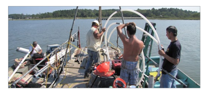
CMT Systems were installed at the bottom of a bay to measure submarine groundwater discharge. Eight 7-Channel CMT Systems were installed, with custom modifications to suit the open water application. Watertight wellheads had to be custom built to allow for sampling from the surface of the bay using a peristaltic pump.