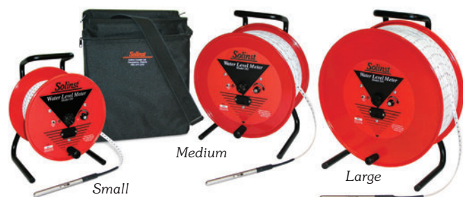
Model 101 Water Level Meter Reels CE

* PVDF laser marked tapes are only available in these lengths